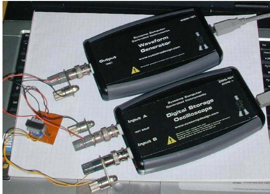
Figure 2: The Syscomp DSO-101 digital oscilloscope hardware with waveform generator WGM-101 in a typical measurement setup

The digital scope has a significant advantage. The waveform data is a stream of numbers that can be stored, printed, manipulated and displayed as a computer file. Or the waveform data can be inhaled into a spreadsheet for further processing. This is especially important in an university or college laboratory, where students need to manipulate, record and annotate waveforms for lab reports.