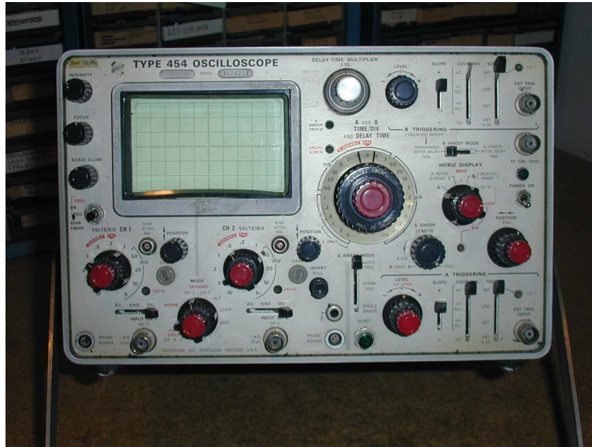
Figure 1: The Classic Tek454 Oscilloscope, the first portable oscilloscope with a 150MHz bandwidth

Analogue oscilloscopes are still available and they are useful, general purpose instruments.